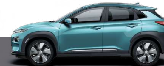
Ceramic Blue - Pearl