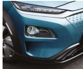
Closed Grille and Twin Headlight Design

Every destination needs a journey. Why settle for less when the Kona Electric is packed with innovative technology and striking design features, to get you there in comfort and style.