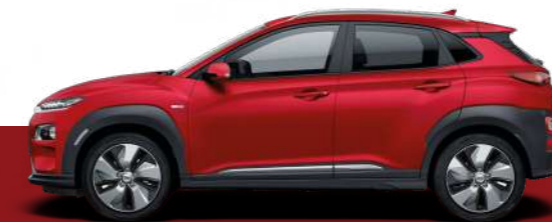
Pulse Red - Metallic/Pearl