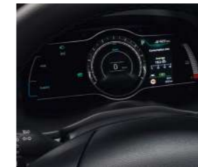
7" Digital Cluster

The simple, sleek interior puts you in control. A perfect blend of advanced technology and elegant design keeps you informed without being distracting, letting you drive with confidence.