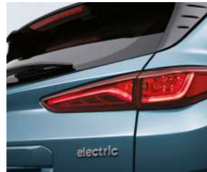
LED Rear Lamps