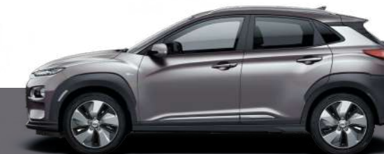
Galactic Grey - Pearl (No Cost Option)