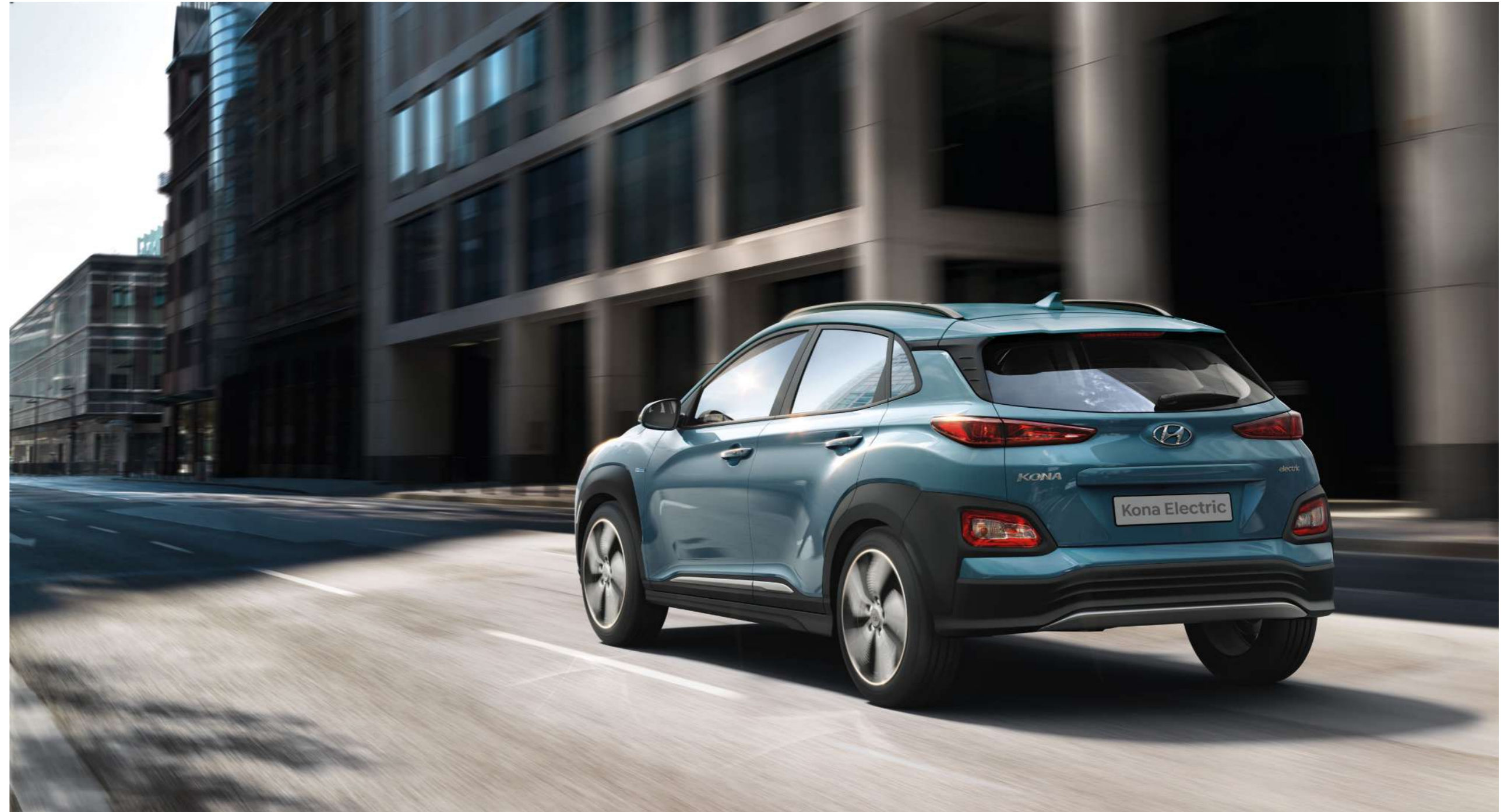
Car shown Kona Electric Premium SE in Ceramic Blue Pearl Paint.

Exceptional style is our standard, with a vibrant range of external colours and varied interiors giving you aesthetic control. The unique closed-off front grille, aerodynamic 17" alloy wheels and the distinct frame add flair to every design, whilst under the hood cutting-edge lithium-ion batteries give you peak performance. The 64kWh battery is liquid-cooled and reliably charge to 80% capacity within 75 minutes using a 50kWh rapid charger, giving you a range of up to 300 miles.