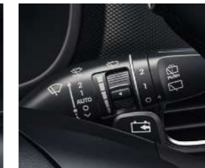
Paddle Shifter (Regenerative Braking Control)