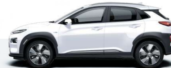
Chalk White - Metallic