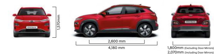
KONA Electric DIMENSIONS

‡‡ These figures were obtained after the battery had been fully charged. The KONA Electric is a battery electric vehicle requiring mains electricity for charging. Figures shown are for comparability purposes. Only compare fuel consumption, CO 2 and electric range figures with other cars tested to the same technical procedures.