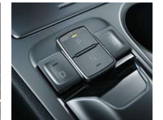
Electronic Gear Shift Button

The Kona Electric's spacious interiors are as comfortable as they are modern. The dashboard boasts an intuitive 7" digital cluster display making critical information readable at a glance, whilst the centre-mounted 10.25" touchscreen gives quick access to car functions including navigation. You can also shift gear into Drive, Neutral and Reverse with a single button press on the central column. What's more, regenerative braking controls on the steering column let you balance acceleration and efficiency by shifting power to the wheels or battery as needed.