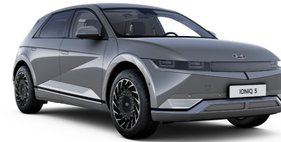
Galactic Grey Metallic