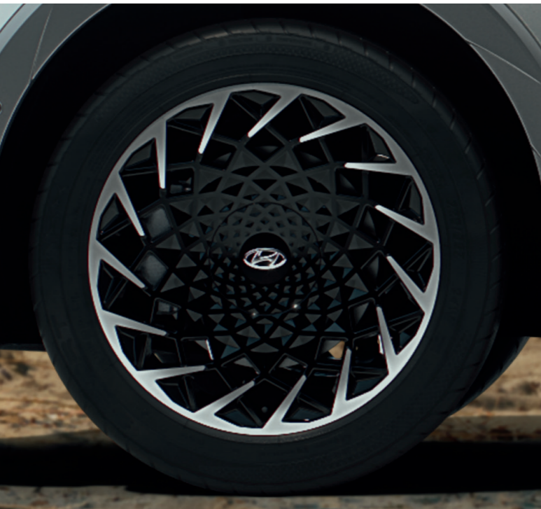
Aerodynamic 20" diamond cut alloy wheels – Ultimate trim.

The IONIQ 5's pure design is a refreshing take on electric vehicles, stripping away complexity to celebrate clean lines and minimalistic structures. The unique clamshell bonnet spans the entire width of the car, minimizing panel gaps for a clean, high-tech look. The LED lighting showcases its signature 256 Parametric Pixels – jewel-like design elements that will feature on the exterior of all future IONIQ models.