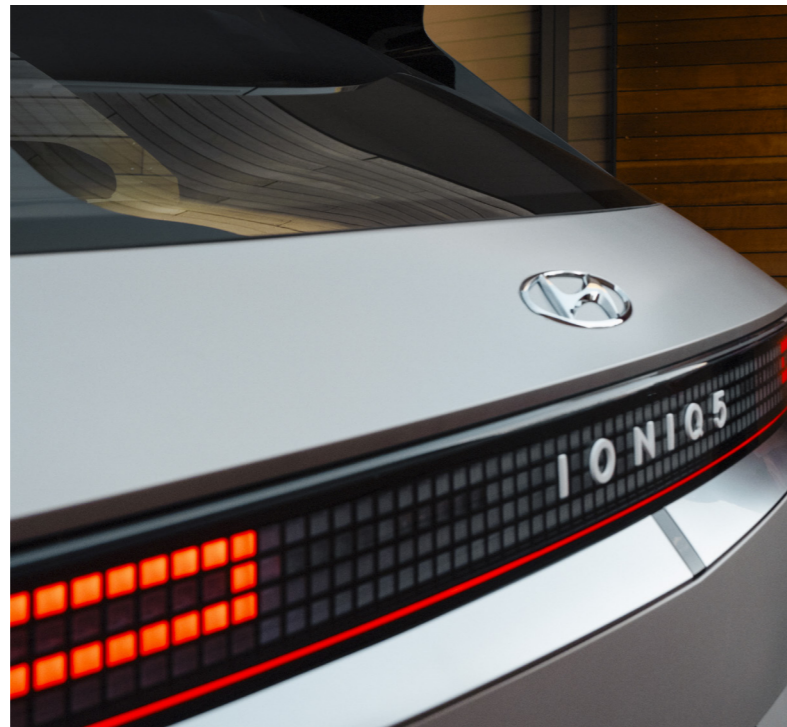
Signature Parametric Pixel rear light design.