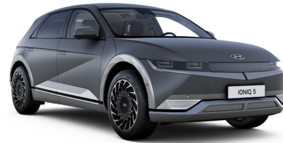
Shooting-Star Grey Matte