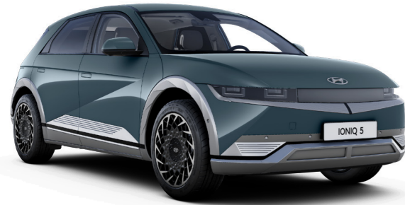
Digital Teal-Green Pearl