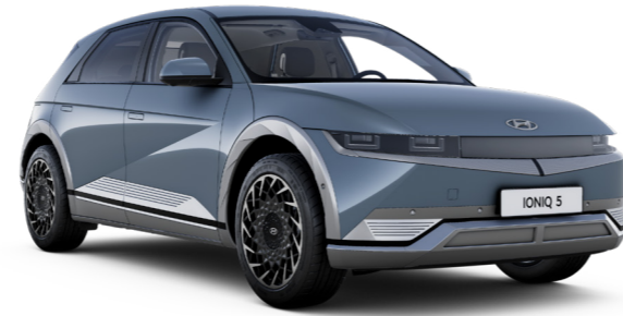
Lucid Blue Pearl