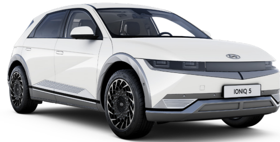
Atlas White Solid

Paint finishes to complement the overall uniqueness of the IONIQ 5.