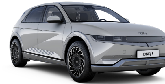
Cyber Grey Metallic