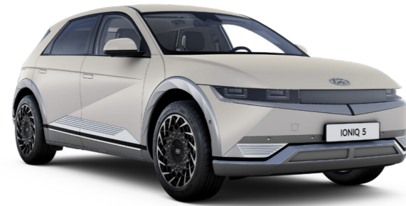
Gravity Gold Matte