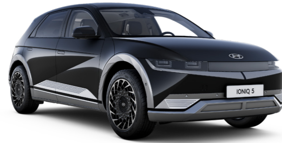
Phantom Black Pearl