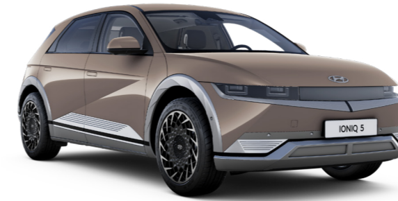
Mystic Olive-Green Pearl